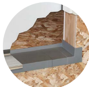
Jamsill Guard® Sill Pan